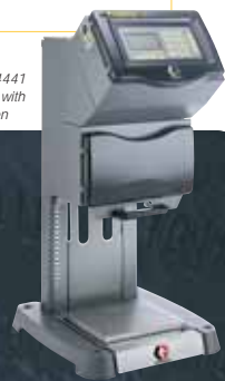
Part No. 244441 Floor model with 45° tilt screen

Finally there's an inexpensive alternative to the expensive kitting of small batches! ProBatch™ offers an EASY, ACCURATE batch system that will REDUCE WASTE and SAVE MONEY. ProBatch is specifically designed for the cost-conscious individual who uses many colors in low volume.